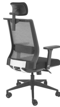
HU-X15 Headrest option available.

These Chairs Meet BIFMA Testing Standards.