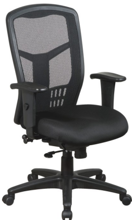
ES-3957 SS $545

2:1 synchro-tilt, ratchet back, height adjustable, tilt tension, and height/width adjustable arms.