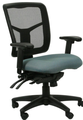
ES-3937 SS $530

2:1 synchro-tilt, ratchet back, height adjustable, tilt tension, and height/width adjustable arms.