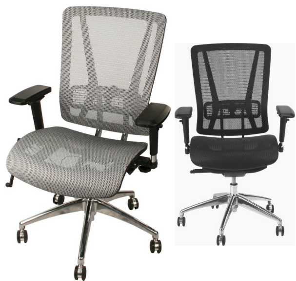
HU-T-086-B-M BLACK or SILVER $780

Great value with black mesh back. Custom upholstery available.