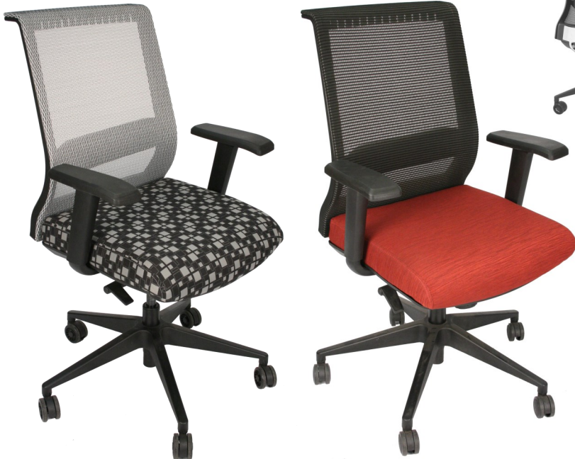
HU-X15 Synchro SILVER or BLACK $480